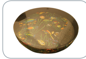
Large Ocean Drum