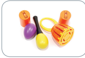
Shakers and Bells