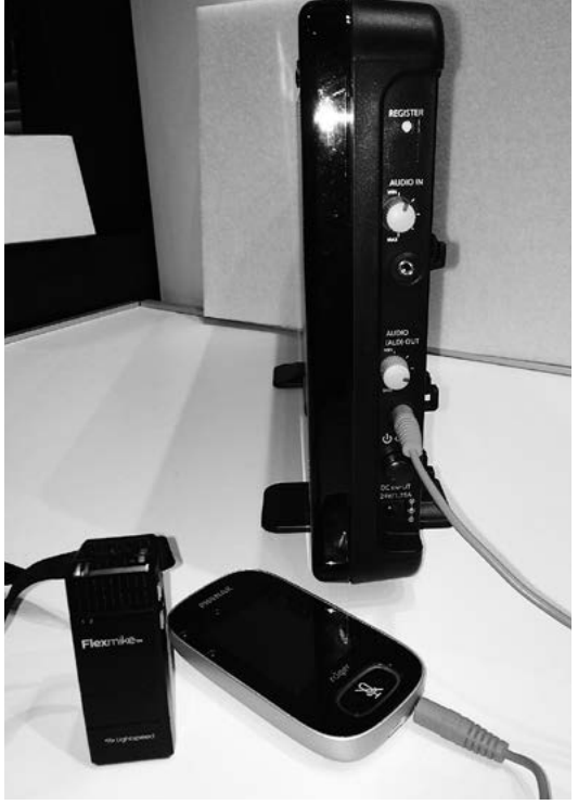
A Redcat soundfield system