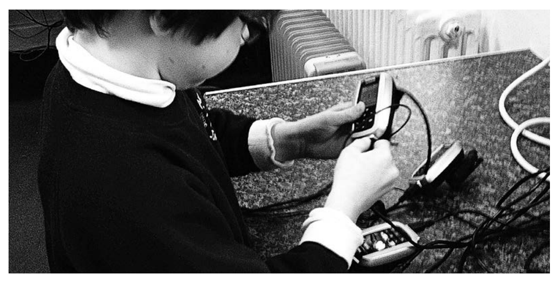
A pupil putting his personal transmitter on charge.